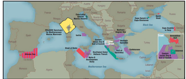
Marine Mammal protected areas of ACCOBAMS.

Worldwide, more than 375 Marine Protected Areas (MPAs) have been specifically designated for or include populations of marine mammals (Hoyt, 2005). MPAs have been identified as a critical tool for managing ocean resources, yet their effectiveness is challenged by the highly mobile nature of marine species. Marine mammals may use key habitat within MPA boundaries, but they typically spend significant time elsewhere, often at great distances and in the waters of other countries. The establishment of MPA networks has been proposed as a strategy for managing highly mobile marine mammals (Hoyt, 2005; Notarbartolo di Sciara, 2007). In addition to formal relationships between MPAs, there is also a need for managers charged with protecting marine mammals to improve communication. Most marine mammal MPA practitioners work in isolation in all corners of the world from the Chilean fjords to Pacific islands, often “re-inventing the wheel,” as there has been no effective forum for marine mammal MPA managers, scientists, and educators to share their knowledge and experiences. Recently, an international group of marine mammal and MPA experts formed a steering committee that met in Hawai‘i to address this need. The result is this proposal for the First International Conference on Marine Mammal Protected Areas.